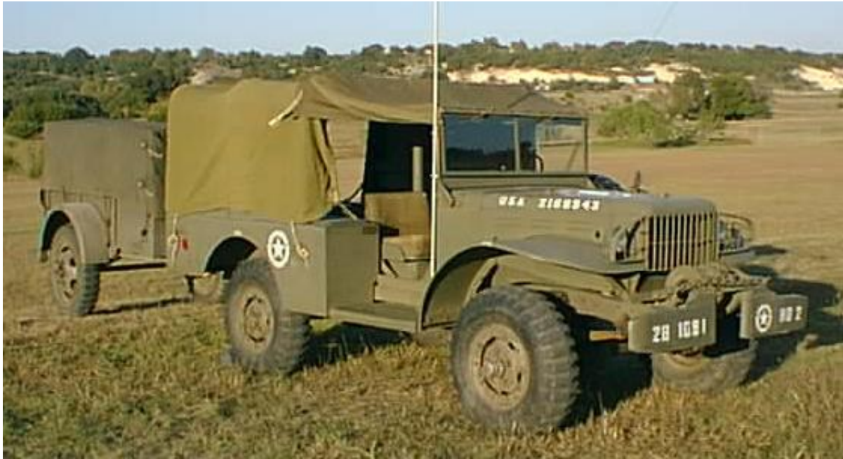
The Museum's 1942 WC-52 and 1942 Ben Hur 1-ton trailer