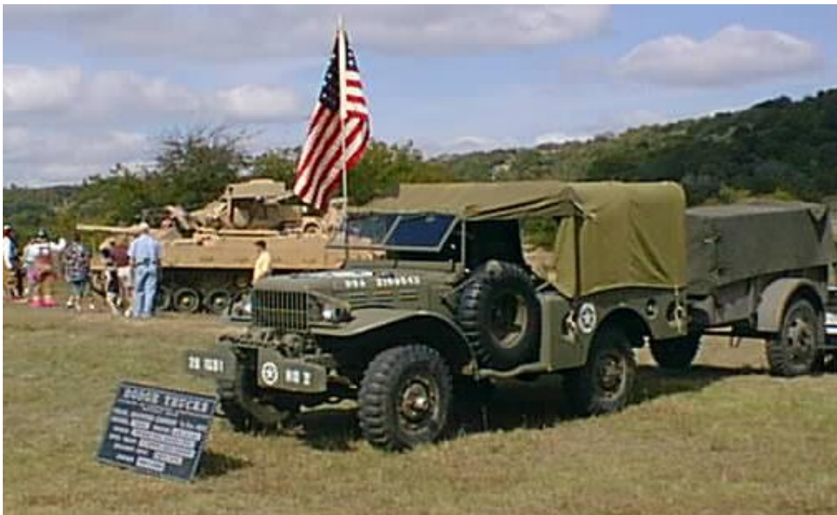
In background, M-2 Bradley Infantry Fighting Vehicle, and M-1 Abrahms Main Battle Tank